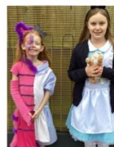
World Book Day at playtime.