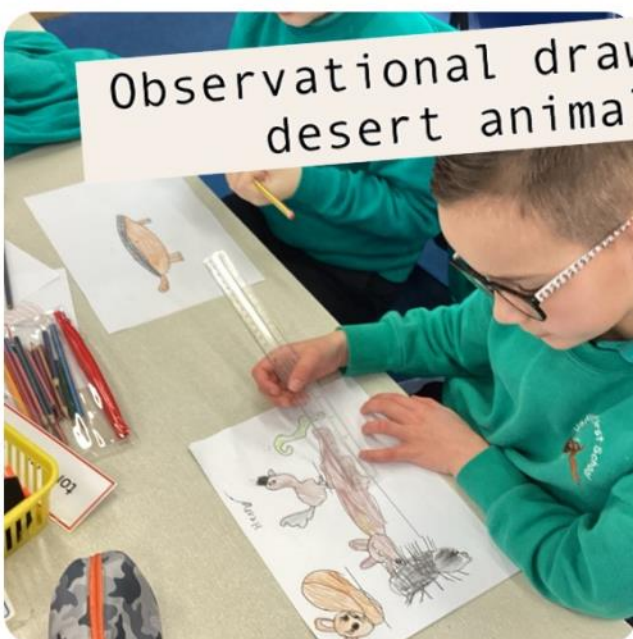
Observational drawing of desert animals