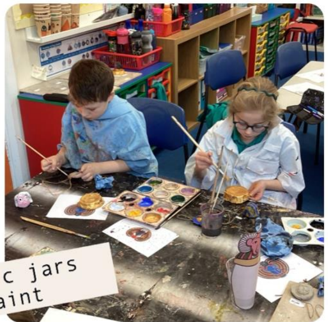
Painting our canopic jars using acrylic paint