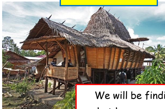
Houses on stilts