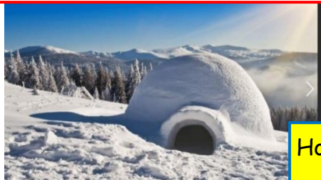
Houses made from snow and ice.

We are going to be looking at homes in different countries and homes that can be moved.