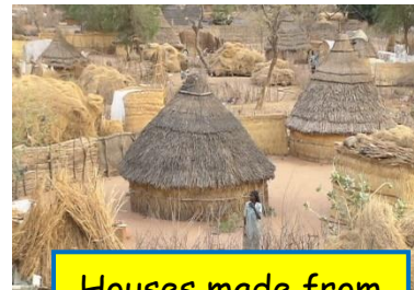
Houses made from mud and straw

We will be finding out what homes were like in the past.