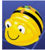
This is Beebot!

We will be listening to the story of Jim and the beanstalk and measuring different parts of our body!