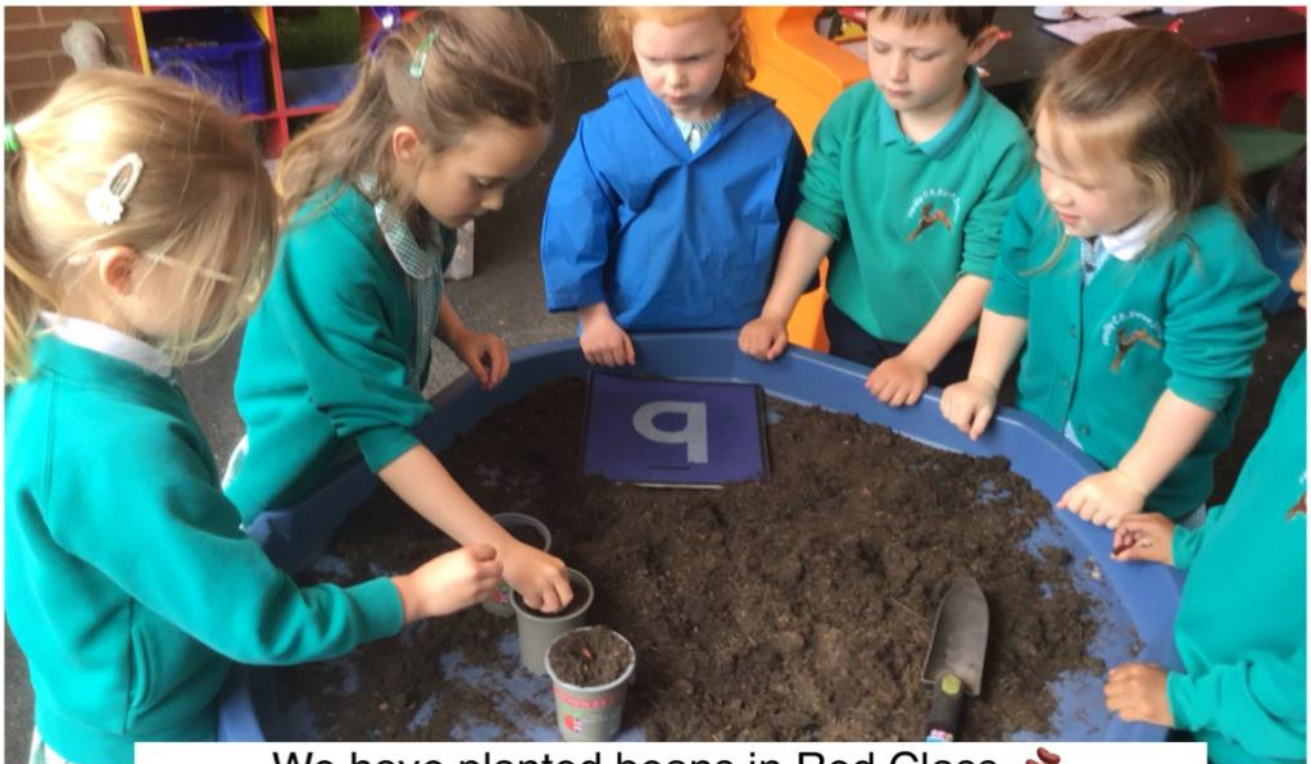
We have planted beans in Red Class. 🌱