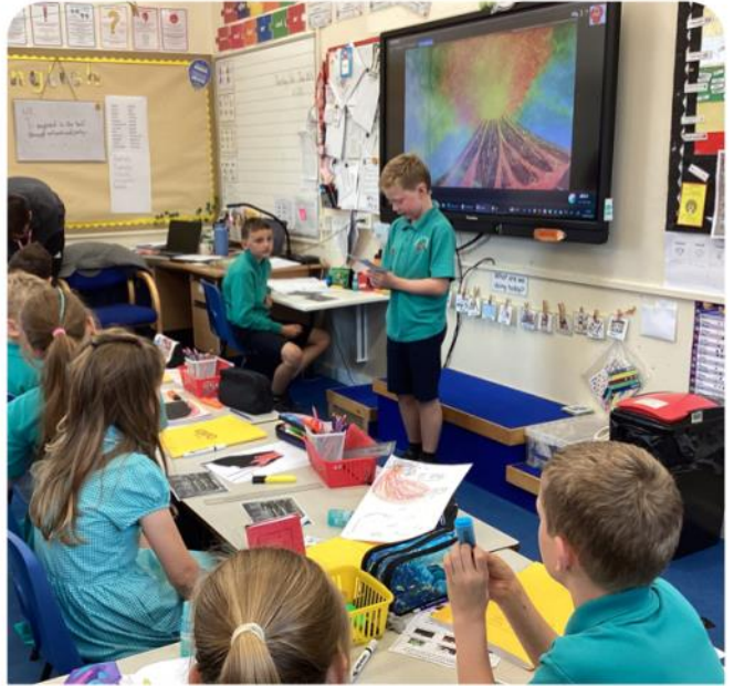
Orange class created blackout poems about a volcano from a familiar text- Pebble in my Pocket.