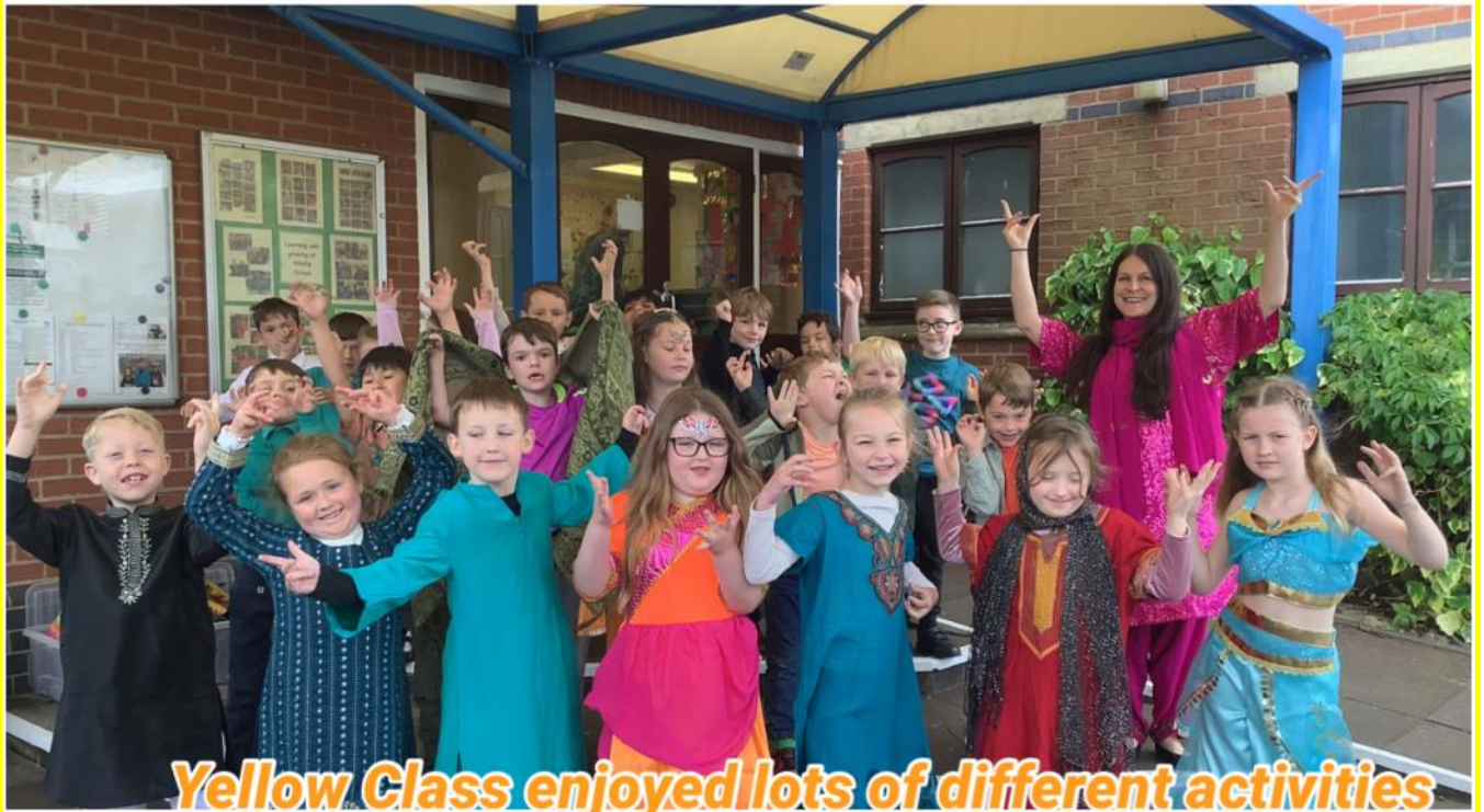
Yellow Class enjoyed lots of different activities during their India Day.