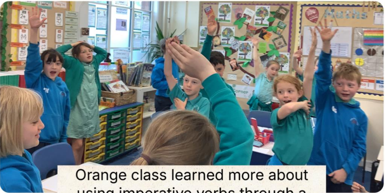
Orange class learned more about using imperative verbs through a game of Simon says.