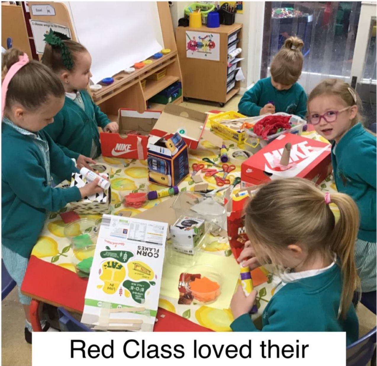
Red Class loved their junk modelling.