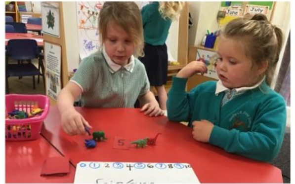
Learning to group and share. 🎲