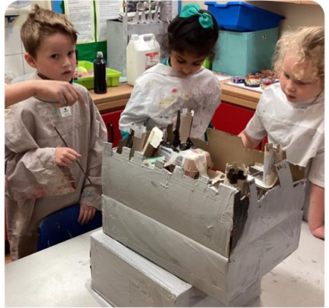
In DT Blue Class created some awesome castles. 🏰,