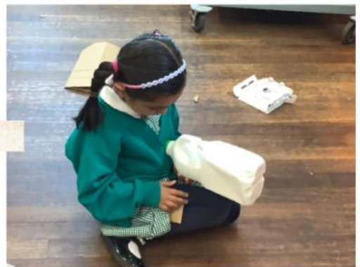
Little Deer Junk Modeling. Great work. 👍