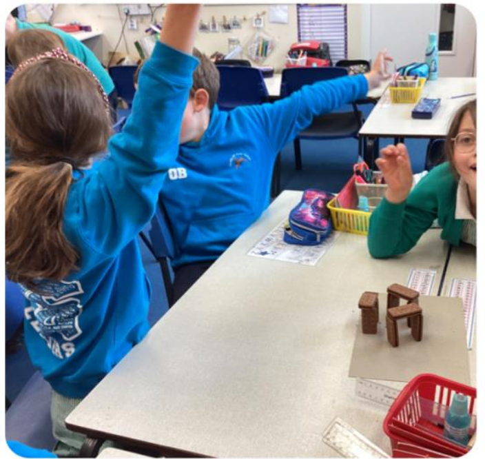
Orange class created their own versions of Stonehenge using bourbon biscuits