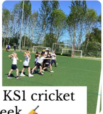
We had a great time at the KS1 cricket festival at RGS this week 🏏