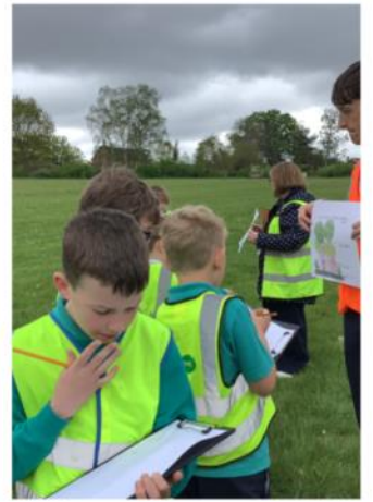
Orange Class investigated how the trees at Bull Meadow have grown (& then took the opportunity to have a short play on the new play equipment!)