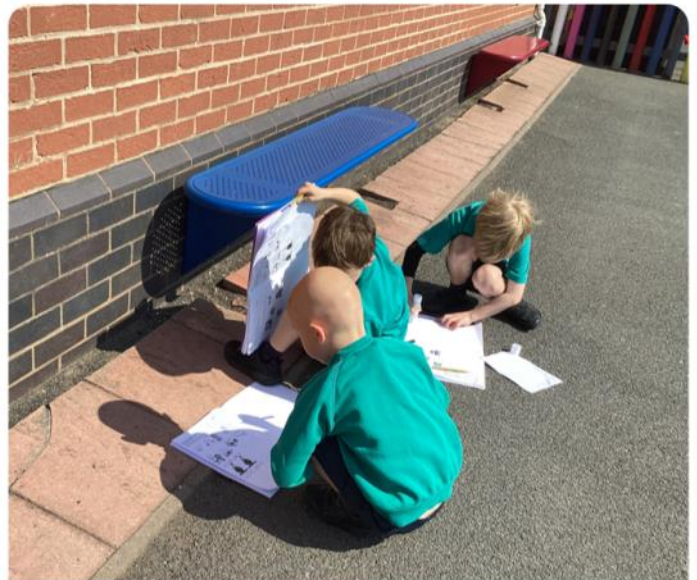
Blue Class had a fab time this week doing a phonics treasure hunt outside ☀️