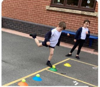
Blue Class have worked hard on their balancing skills this week.