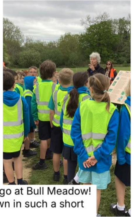
Measuring the trees that we planted 18 months ago at Bull Meadow! We were amazed at how quickly they have grown in such a short space of time.