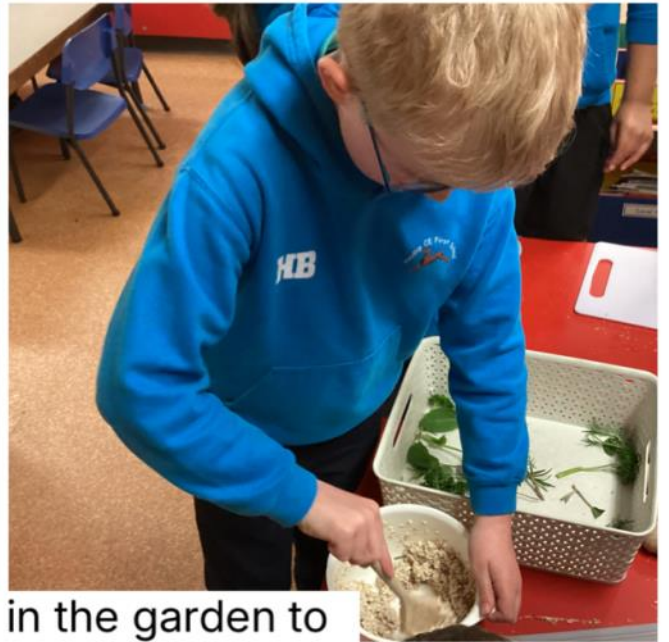
Foraging for herbs in the garden to add to our Stone Age bread.