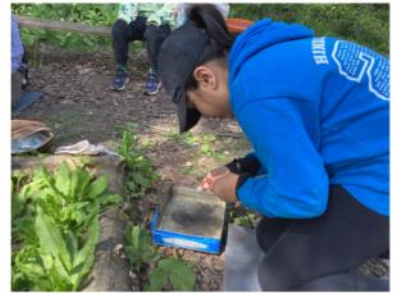
Building shelter, hunting animals, beautiful flowers, making fishing net