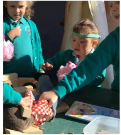
Red Class acted out the "Three Little Pigs" story.