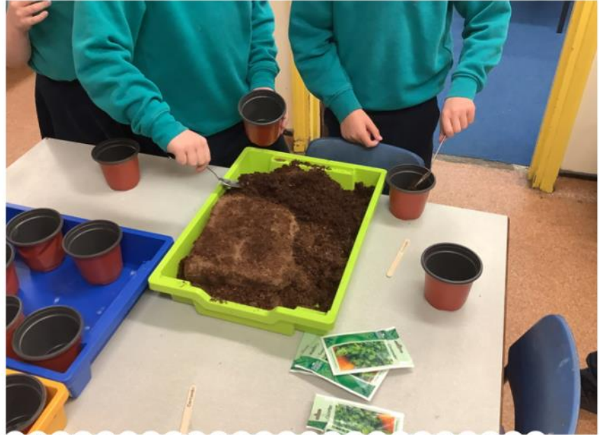
Yellow Class have been learning how to care for plants and what they need to grow.