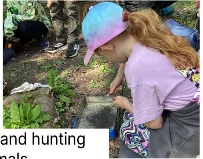
Making fire and hunting animals