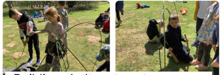
Building shelters to set up a new camp so we can find food