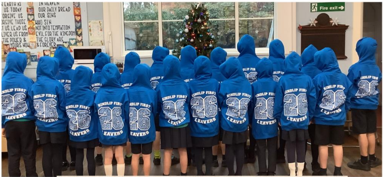
Leavers' Hoodies have arrived.