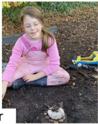
What a wonderful endpoint to our Aztec & chocolate topic!