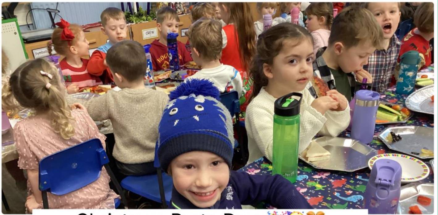
Christmas Party Day. 🎉🥳🎊