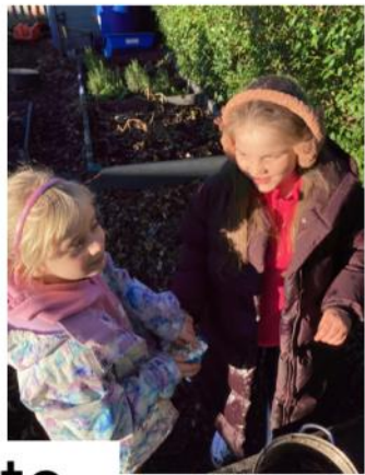
Popcorn & hot chocolate