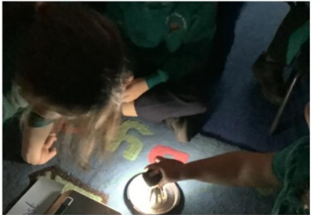
Investigating which materials and surfaces are most and least reflective.