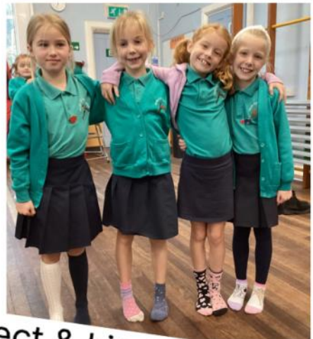
Respect & kindness