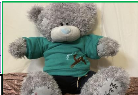
Attendance Ted is awarded to Yellow class for their 98.6% attendance last week.

Nuts in School: We are a nut free school therefore no nut products of any sort are allowed in school.