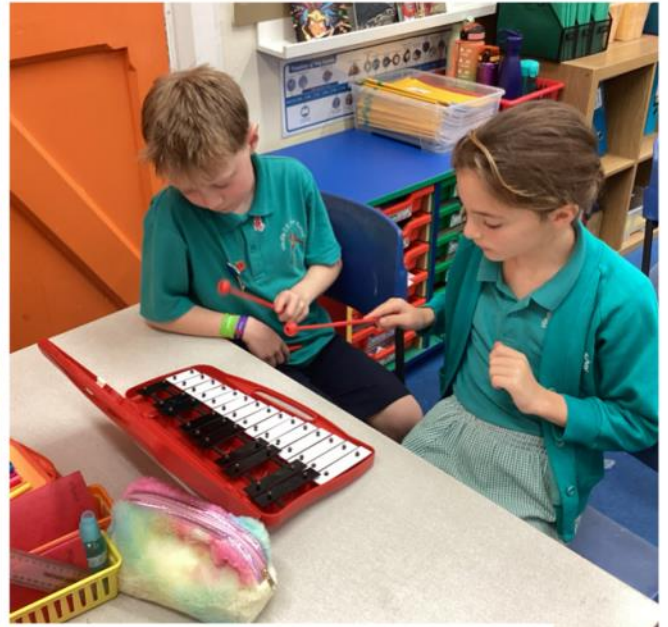
Playing the glockenspiel in Music