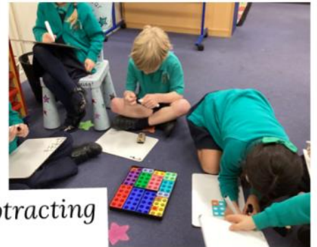
Blue Class have been working really hard this week subtracting in Maths.