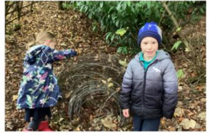
Blue Class had a fab walk up to the woods. We are planning a route to help Henry hedgehog find his way home. 🦔🏠