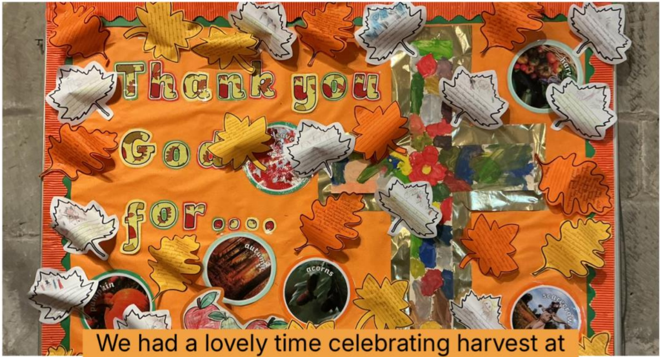
We had a lovely time celebrating harvest at church! 🍁 Thank you for all your generous food donations.