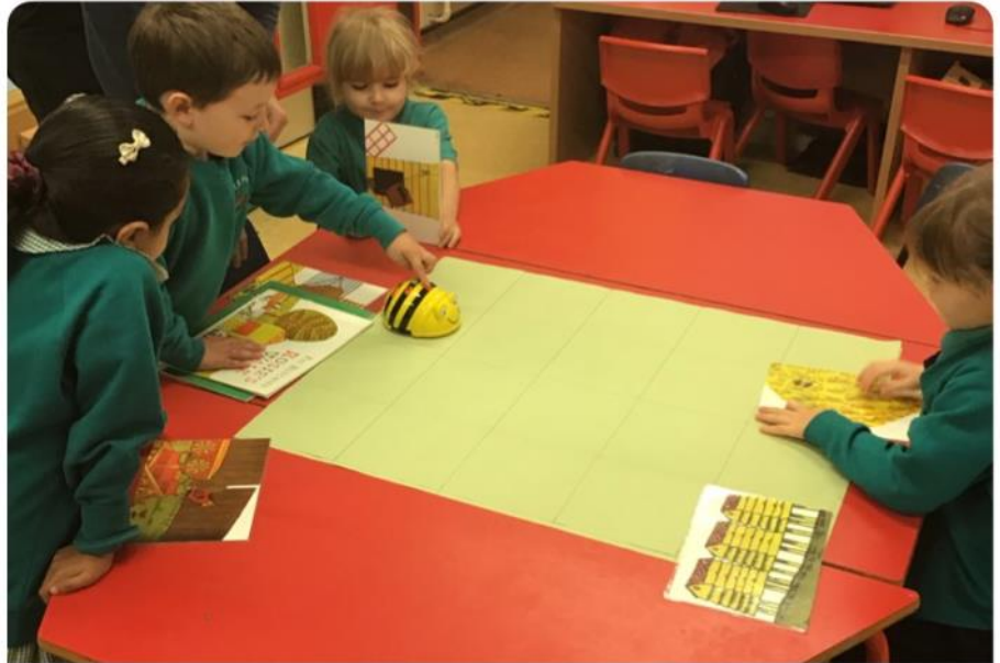
We created a walk using Bee Bots.