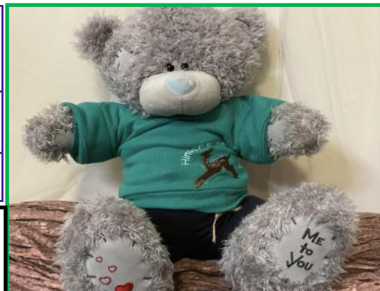
Attendance Ted is awarded to Red Class for their 100% attendance last week.

Nuts in School: We are a nut free school therefore no nut products of any sort are allowed in school.