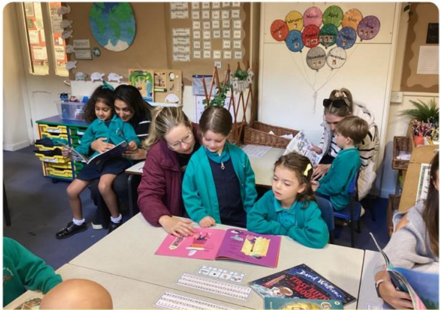
Reading Morning was busy this week. 📖 📚