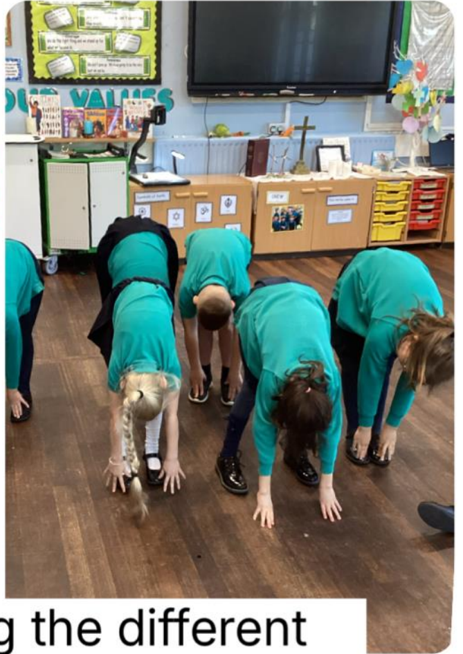
Investigating the different layers of the rainforest