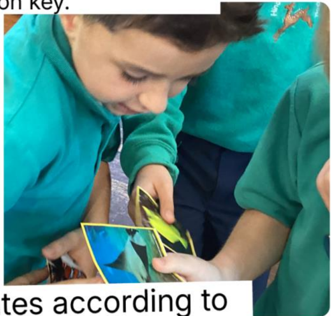
Sorting vertebrates according to their differences.