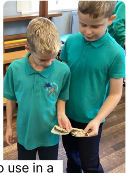
Generating and asking questions to use in a classification key.