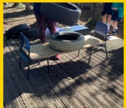
Yellow Class science experiment to see which material would be strongest for building a bridge.