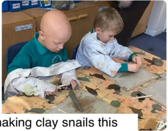
Blue Class enjoyed making clay snails this week 🐌