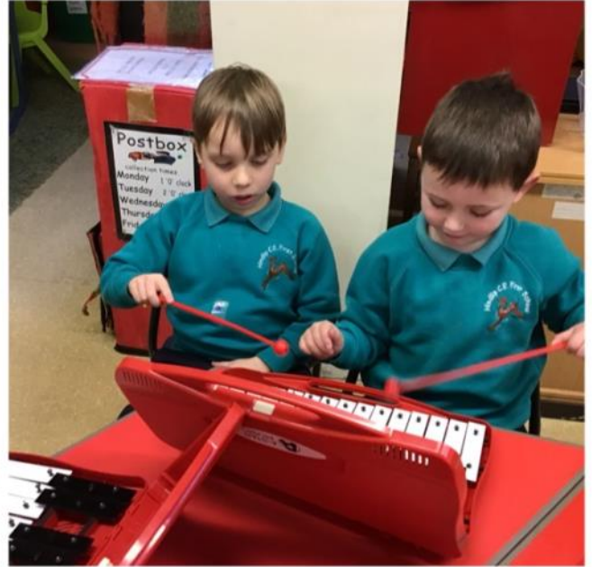
Red Class loved their music lesson using the glockenspiels. 🎵🎵🎵