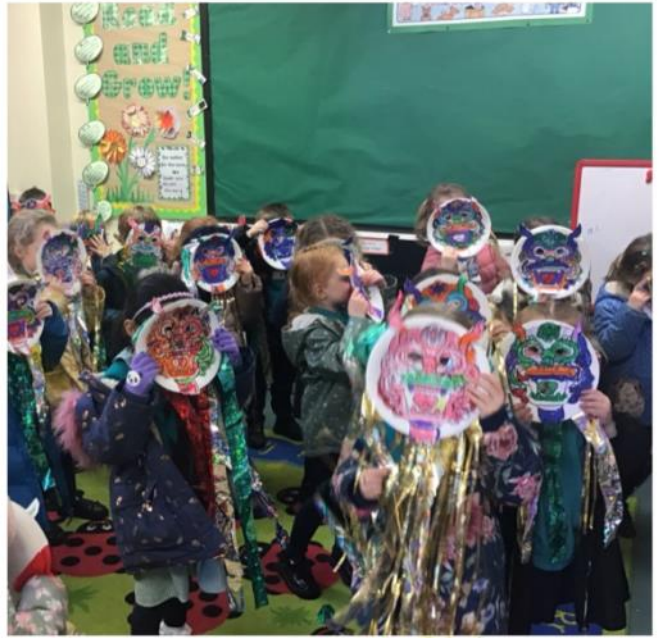
We have been learning about the Chinese New Year. 🇨🇳🏮