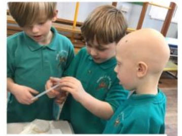
Blue Class carried out a Science investigation this week to find out what the most suitable material for an umbrella for Teddy would be. They found out that plastic was waterproof.