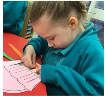
Weaving in Red Class was such fun.