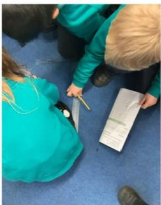
Yellow Class are investigating how we grow at different rates. 📏💡