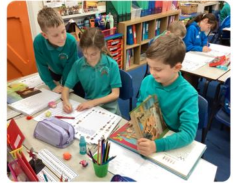
Orange Class have been working really hard to develop their setting and character description when writing stories. They did such a great job! Well done Orange Class!